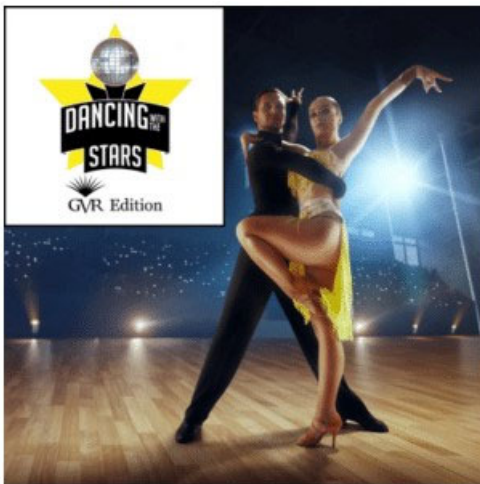
Dancing with the Stars–GVR Edition Wednesday, February 5, 7pm