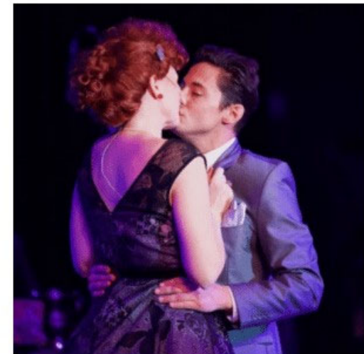
I Love Lucy Friday, February 21, 7pm