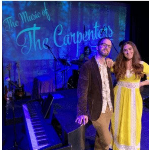
The Music of the Carpenters Tuesday, February 11, 7pm